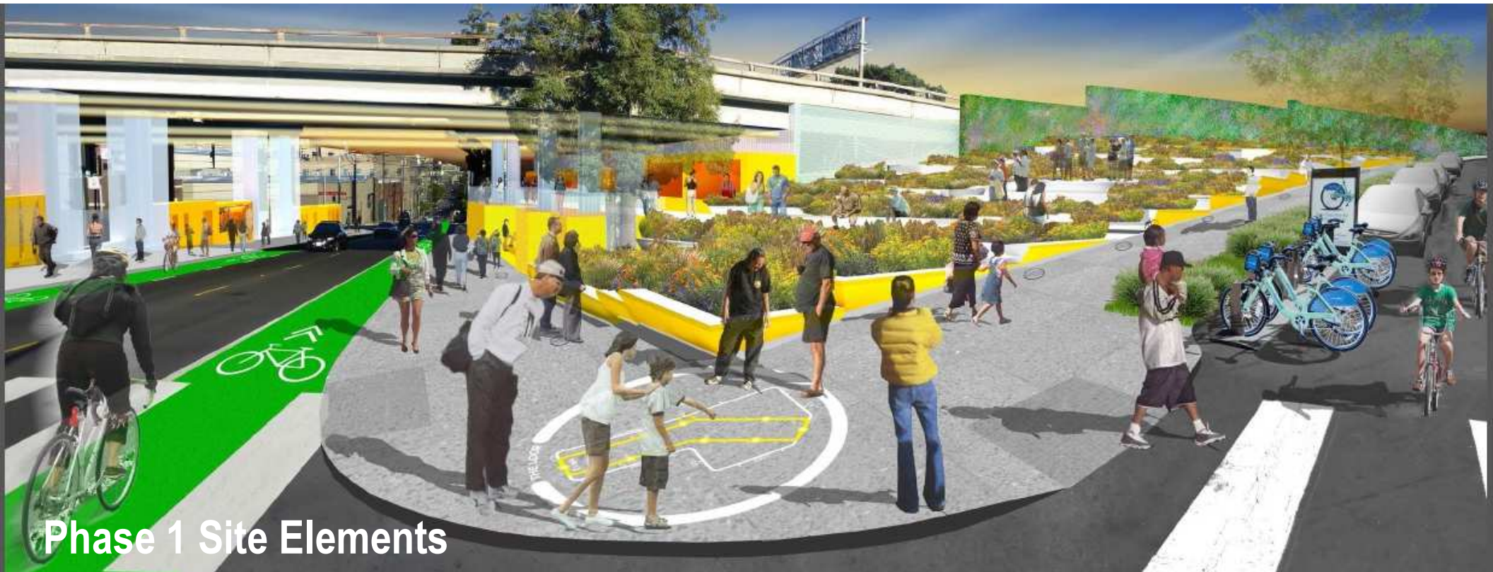
Phase 1 Site Elements

Street furniture: bike racks, benches, waste receptacles