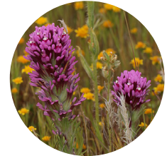
Purple Owl's Clover ©2018 Walter Siegmund "Castilleja exserta 8031.JPG" - https://commons.wikimedia.org/w/File:Castilleja_exserta_8031.JPG