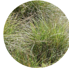
Clustered Field Sedge