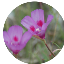
Ruby Chalice Clarkia