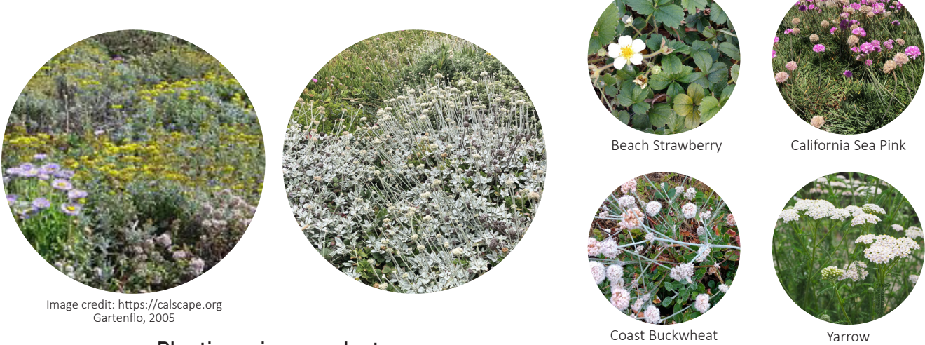
Planting mix precedents