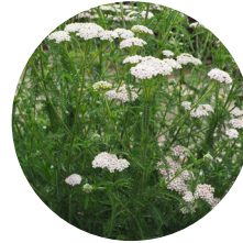
Sonoma Coast Yarrow