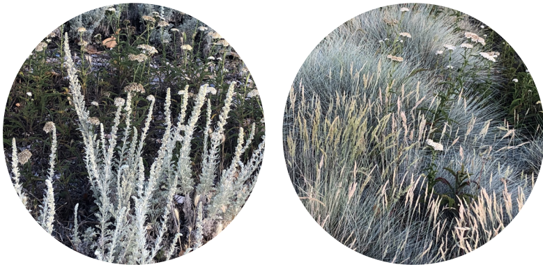
Planting mix precedents