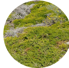
Prostrate Coyote Bush