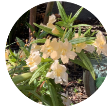
Sticky Monkey Flower