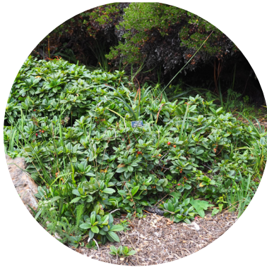
Planting mix precedent