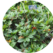
Mound San Bruno California Coffeeberry