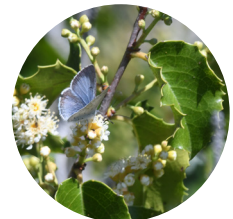
Coast Live Oak