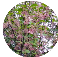
Pink Flowering Currant