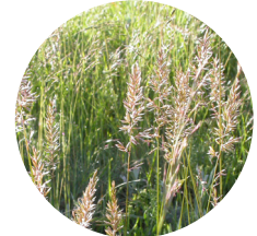
Prairie Junegrass