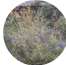
Purple Needlegrass & Ithuriel's Spear