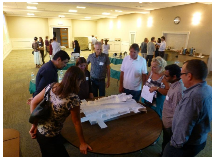
Neighbors review scale model of project area

Workshop 2 will be held August 22 at the Russian Gospel Church.