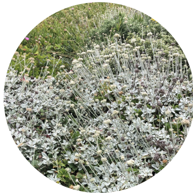
Planting mix precedents