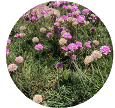
California Sea Pink