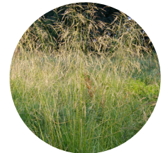
Tufted Hairgrass