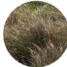
Pacific Reedgrass