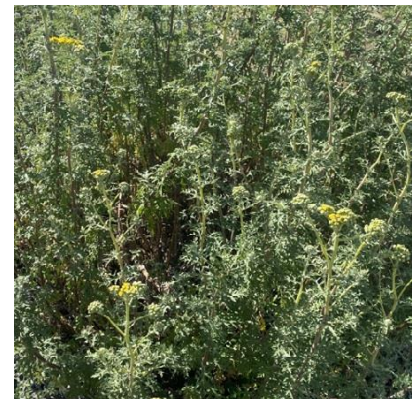
Seaside Woolly Sunflower